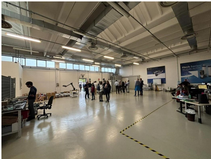
Figure 1: Consortium at IBT premises

In the afternoon, participants visited IBT's site to see the collaborative robots (cobots) in action, followed by a networking dinner (picture below).